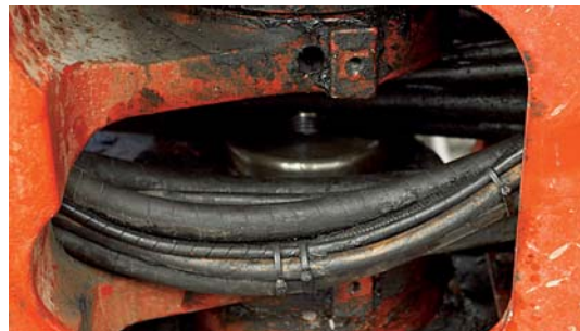
7. The Expander system is in place. The completely flat, in principle, lock nut sits in the centre of the hose coil – without “chafing”