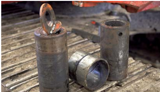
2. Removed broken bolts and bearings.