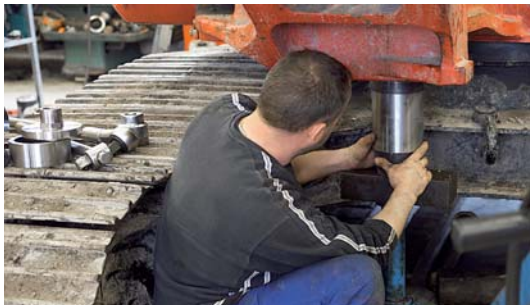
4. Position the bolt correctly for insertion and push into place using a jack.