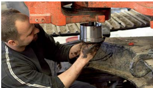
6. The bottom expansion sleeve is put in place. Tightening and re-tightening is carried out from below.