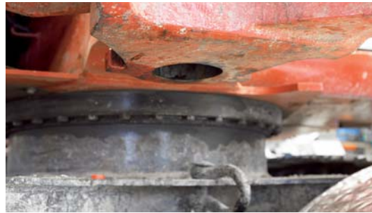
1. The old axle has been removed. Despite joint play and some ovality, the new Expander system can be fitted without line-boring or material application

The principle is standard, but to compensate for the joint play, a special dimension needed to be adapted for both bearing lug and sleeves.