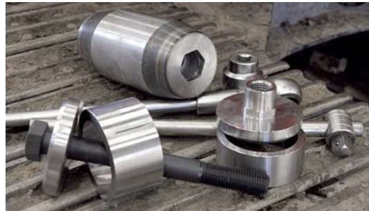
3. The Expander system is ready for assembly. Note the hexagonal recess in the bolt end and corresponding profile on the inside of the lock nut.